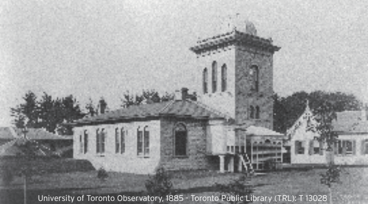
University of Toronto Observatory, 1885 - Toronto Public Library (TRL): T 13028