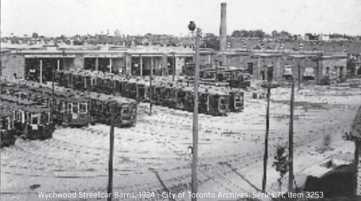
Wychwood Streetcar Barns, 1924