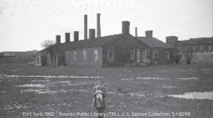
Fort York, 1952